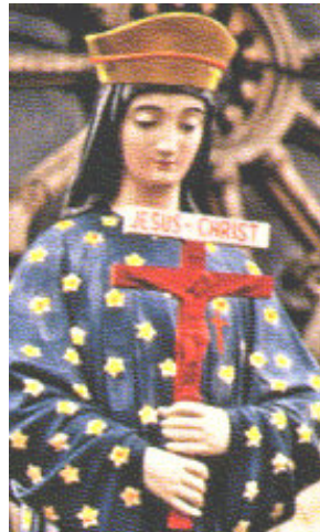
Our Lady of Pontmain

MARY, IMMACULATE QUEEN OF THE UNIVERSE, SPOUSE OF THE HOLY GHOST, MEDIATRIX OF ALL GRACES; TRIUMPH AND REIGN IN THE NAME OF JESUS, AND FOR THE LOVE OF JESUS, NOW AND FOREVER. AMEN.